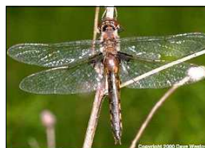
Common baskettail, female.